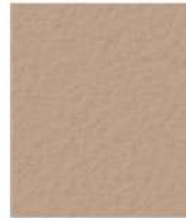
RUSTIC BROWN 2 LBS 6058