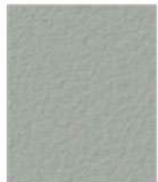
SILVERSMOKE 0.25 LB 8084 * or 1.25 LBS 860