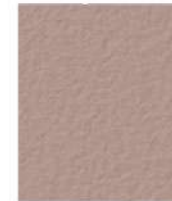
TAUPE 2 LBS 677