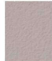
MESQUITE 1 LB 677