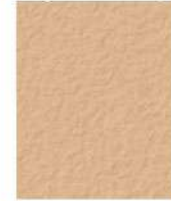
SAN DIEGO BUFF 1.5 LBS 5237