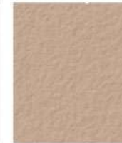
SIERRA 2 LBS 61078