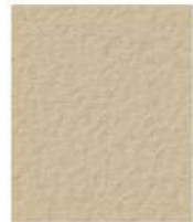
PEBBLE 0.5 LB 641