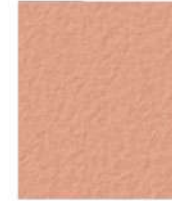
SUNSET ROSE 1 LB 160