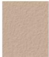
DUNE 0.5 LB 6058