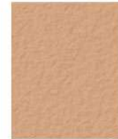
SOUTHERN BLUSH 1 LB 10134