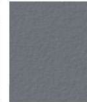
GRAPHITE 2 LBS 8084 *