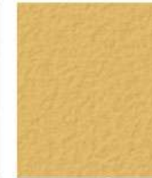
MESA BUFF 2 LBS 5447