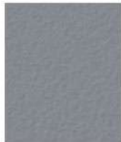
DARK GRAY 1 LB 8084 * or 5 LBS 860

* Caution: 8084 is not compatible with air-entraining admixtures. See back page for more information.