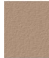
KAILUA 4 LBS 677