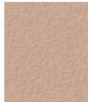
BAYOU 1 LB 6130