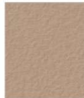
COCOA 2 LBS 6130