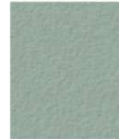
GREEN SLATE 3 LBS 3685