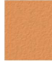
SPANISH GOLD 3 LBS 5084