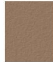
ADOBE 4 LBS 61078