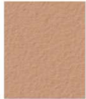
CANYON 0.5 LB 160