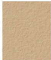
OMAHA TAN 1 LB 5084