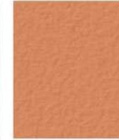
BAJA RED 2 LBS 160