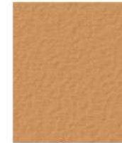
SALMON 2 LBS 10134