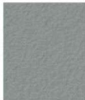
LIGHT GRAY 0.5 LB 8084 * or 2.5 LBS 860