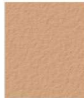
YOSEMITE BROWN 2 LBS 641