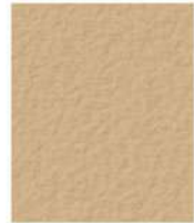
SANDSTONE 0.75 LB 5237

This pdf color card is just for ideas. If you choose a color by viewing this on your PC or from a printout of the pdf file, your colored concrete may be a big surprise. Please make your selection from our printed color card, hard samples or job site test.