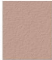
MOCHA 1 LB 6058