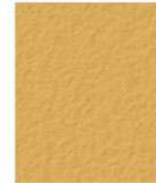
PALOMINO 3 LBS 5447