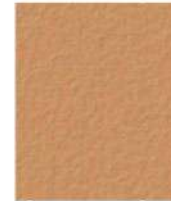
FLAGSTONE BROWN 3 LBS 641