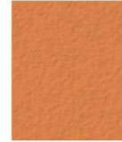
TERRA COTTA 4 LBS 10134