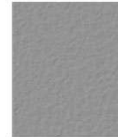
COBBLESTONE 2 LBS 860