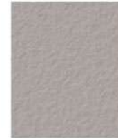
PEWTER 1 LB 860