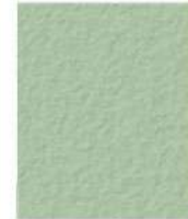
WILLOW GREEN 3 LBS 5376