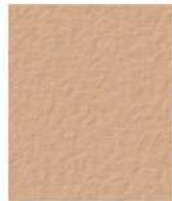
SEQUOIA SAND 1 LB 641