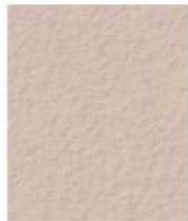
OUTBACK 0.5 LB 677